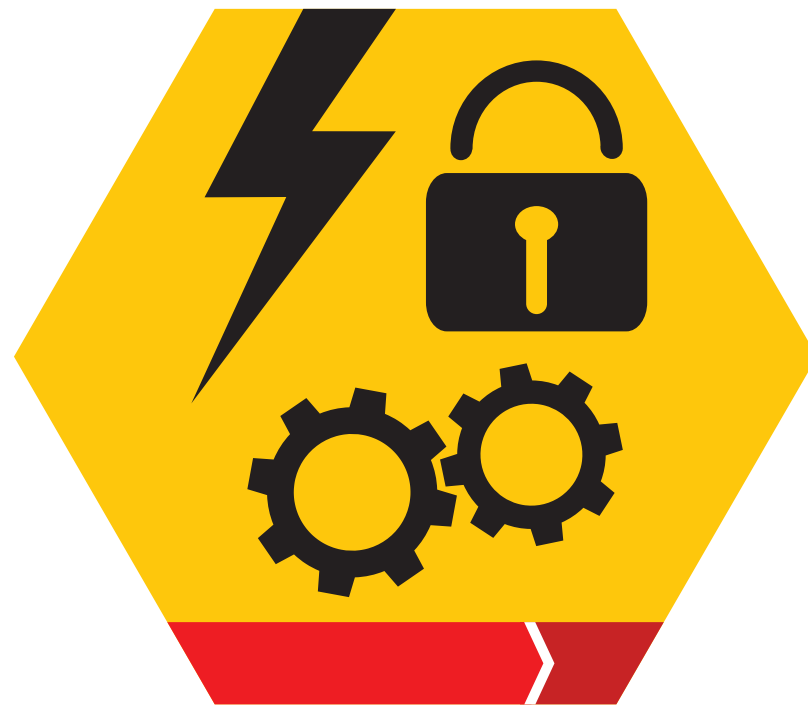
Process/Mechanical/ Electrical Isolations