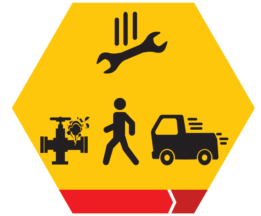
Line of Fire