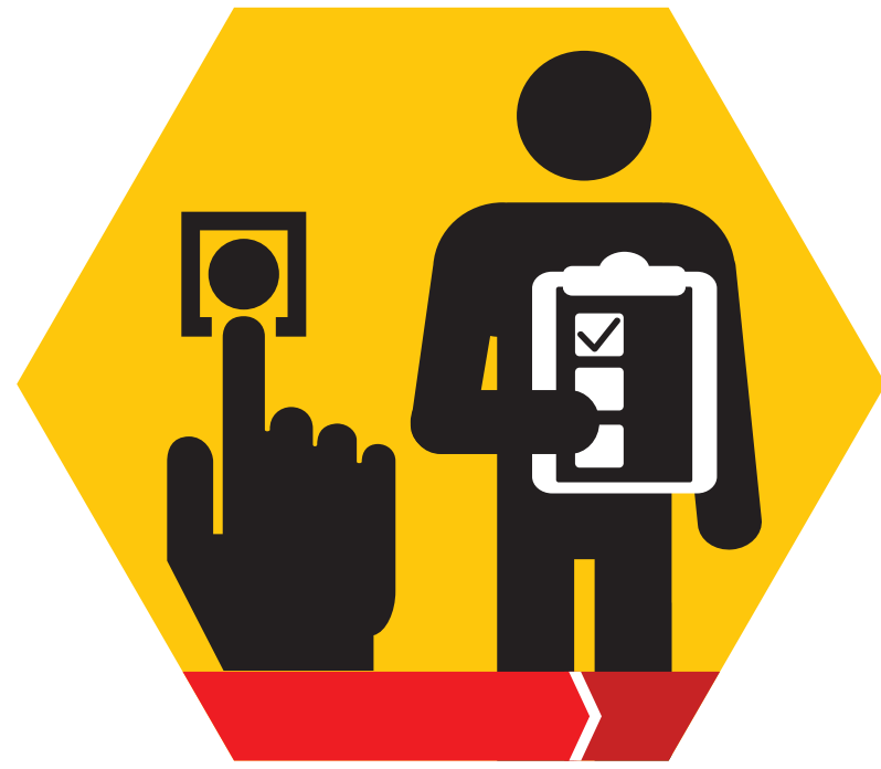
Bypassing Safety Devices