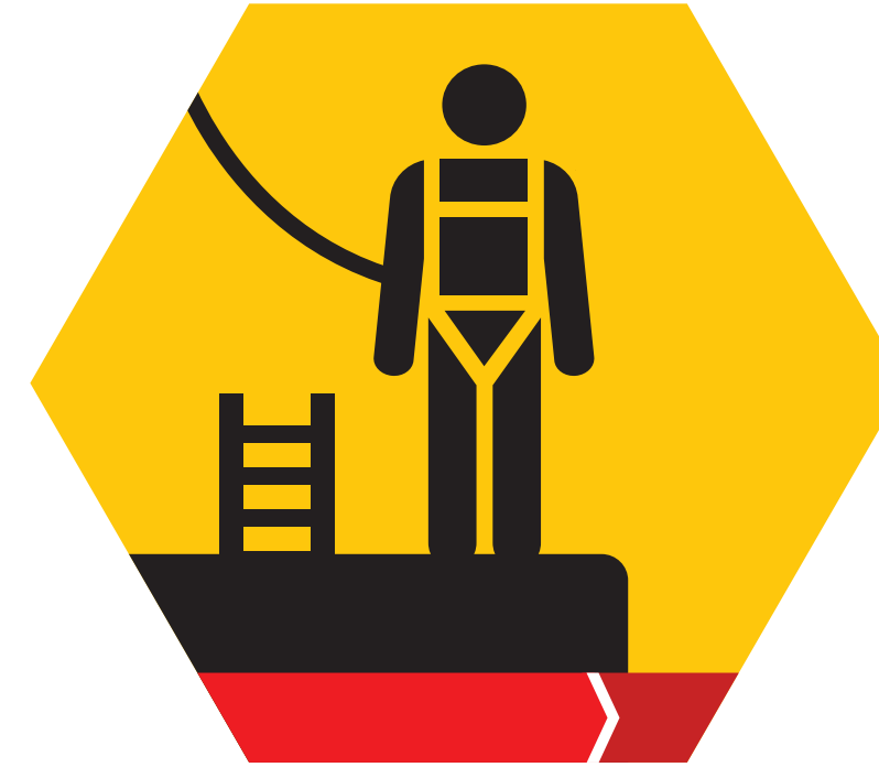
Working at Heights