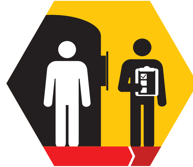
Confined Space Entry