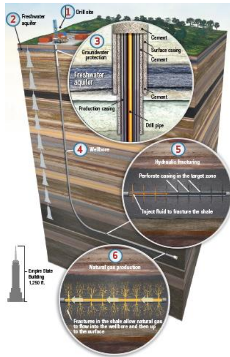
Illustration based on a typical Eagle Ford shale well in Texas.