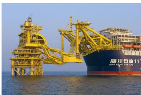
Peng Bo FPSO in Bohai Bay, China